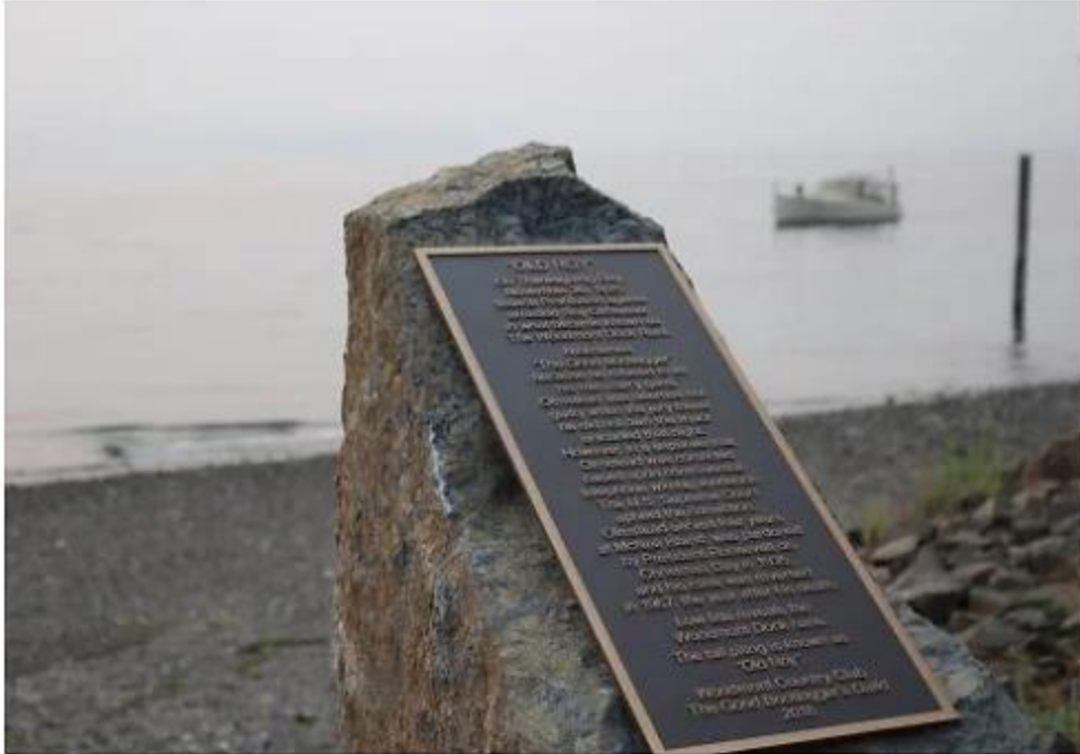
This plaque – installed in 2017 in the Woodmont neighborhood of Des Moines – commemorates where Roy Olmstead was busted by the Feds on Thanksgiving Day, 1925. The piling on the right in the background – nicknamed “Ol’ Roy” – is all the remains from a Mosquito Fleet dock that Olmstead used on his late night rumrunning sessions.